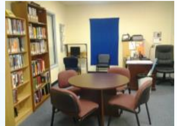
Kingsville Campus-Rm 105A