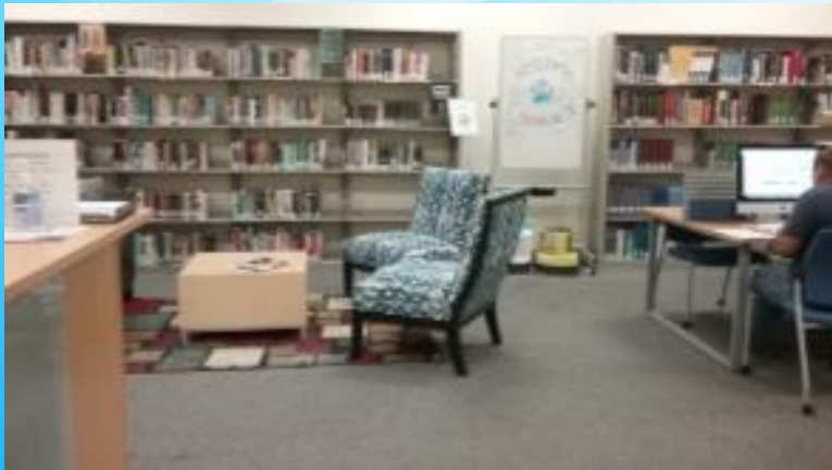
Alice Campus-Room 129